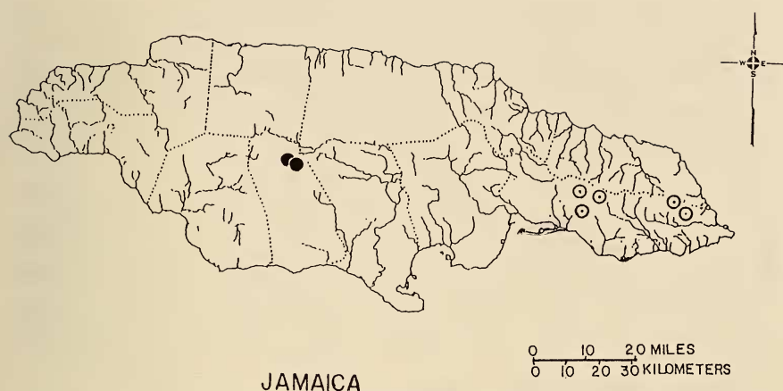
FIG. 2. Known distribution of Anetia jaegeri (solid circles) in central Jamaica, and the locations of sightings of a darker, Anetia -like insect in eastern Jamaica (open symbols) (see also text).

On 2 July 1967, Turner saw a large dark brown or sooty black insect, with pale yellow submarginal bands on both wings, crossing the track one mile north of Barretts Gap on the way to Corn Puss Gap, several miles east of the earlier sightings. On 2 August 1968 a similar insect was observed by Turner, two miles south of Corn Puss Gap, flying 15 ft high in a forest clearing, where it was observed for several minutes. The butterfly was dark brown to sooty black, about four inches in wingspan, and with a clearly visible falcate apex to the forewing. Seen from beneath, the submarginal band on the forewing was pale yellow and broader and more continuous than that of A. cubana . The submarginal marking of the hindwing was not opaque like that of the forewing, and was difficult to discern from below.